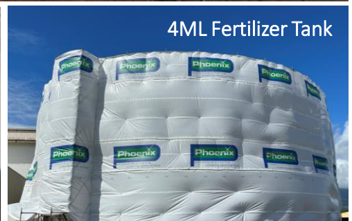
4ML Fertilizer Tank