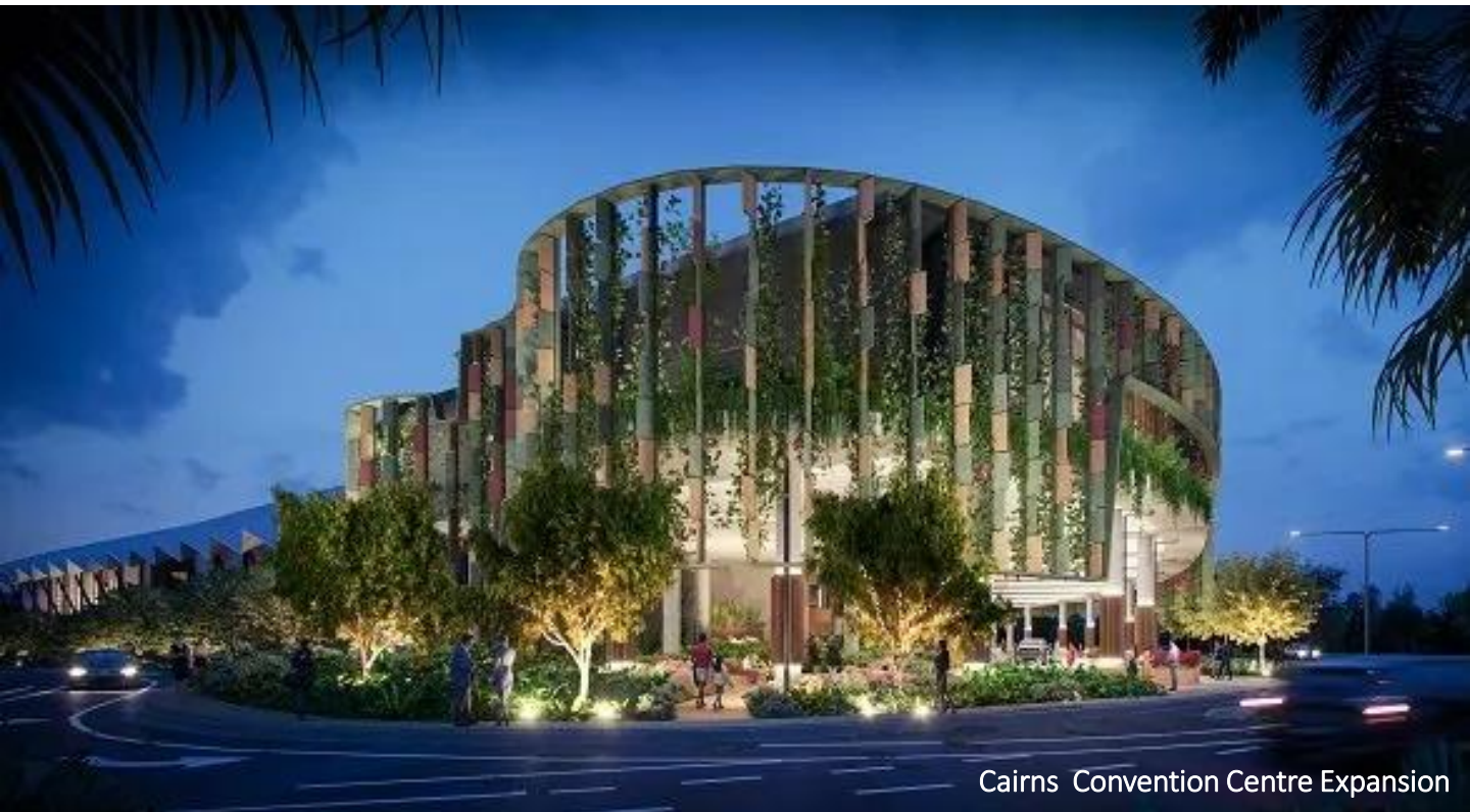
Cairns Convention Centre Expansion