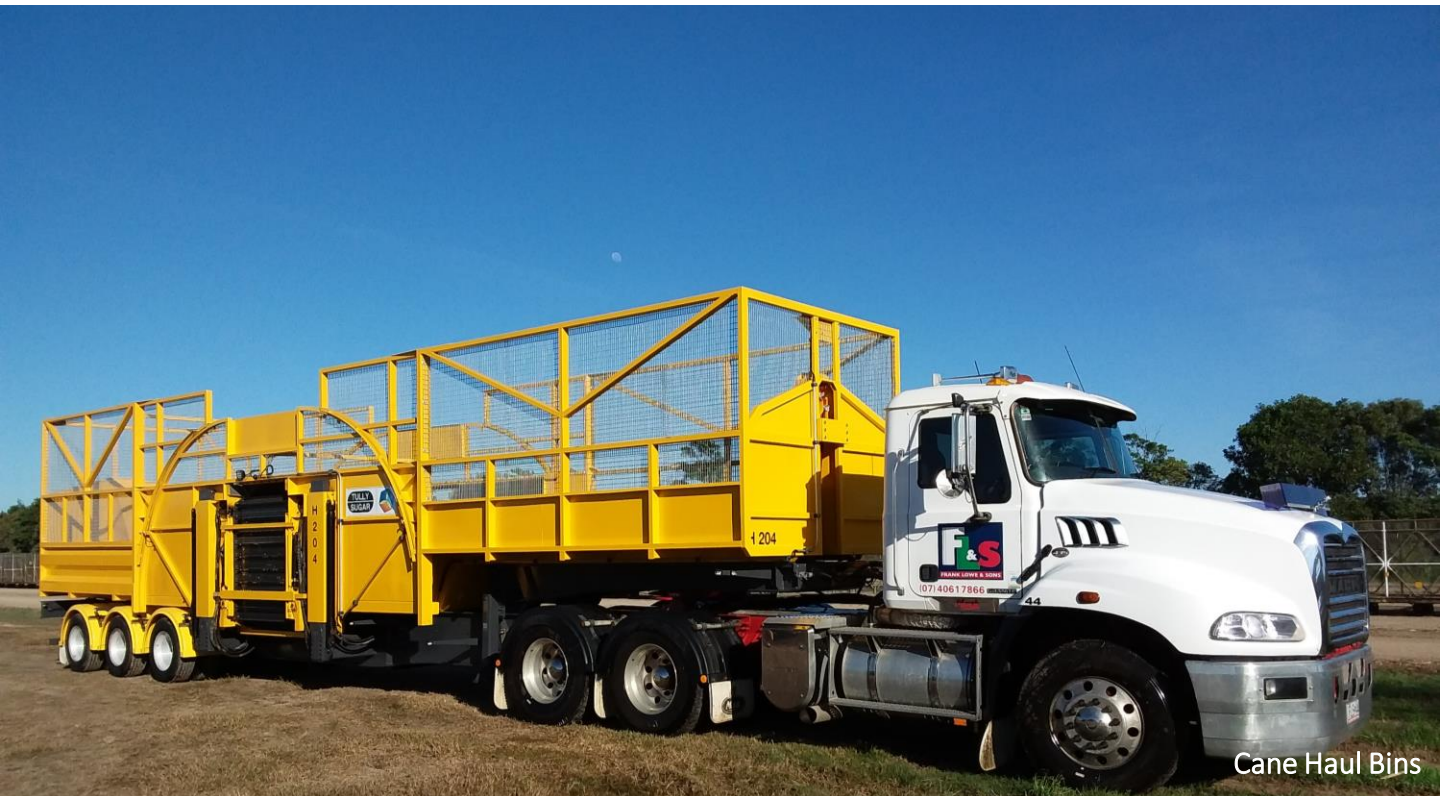
Cane Haul Bins