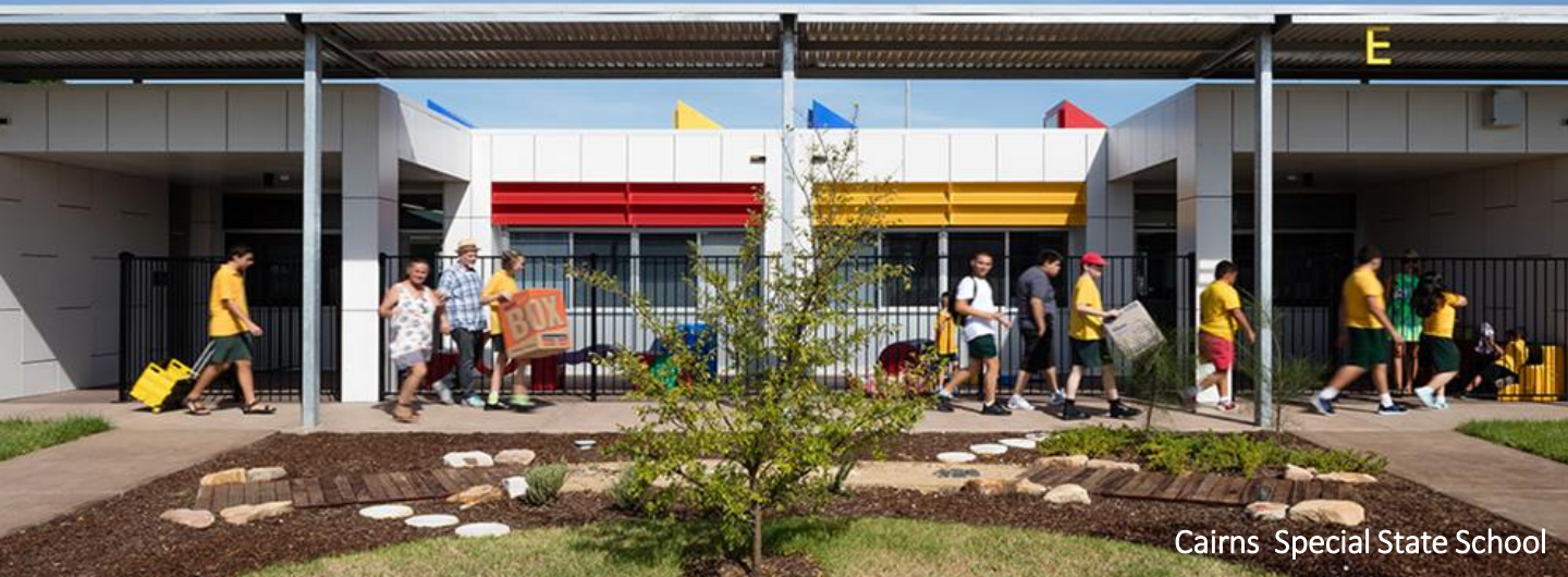
Cairns Special State School