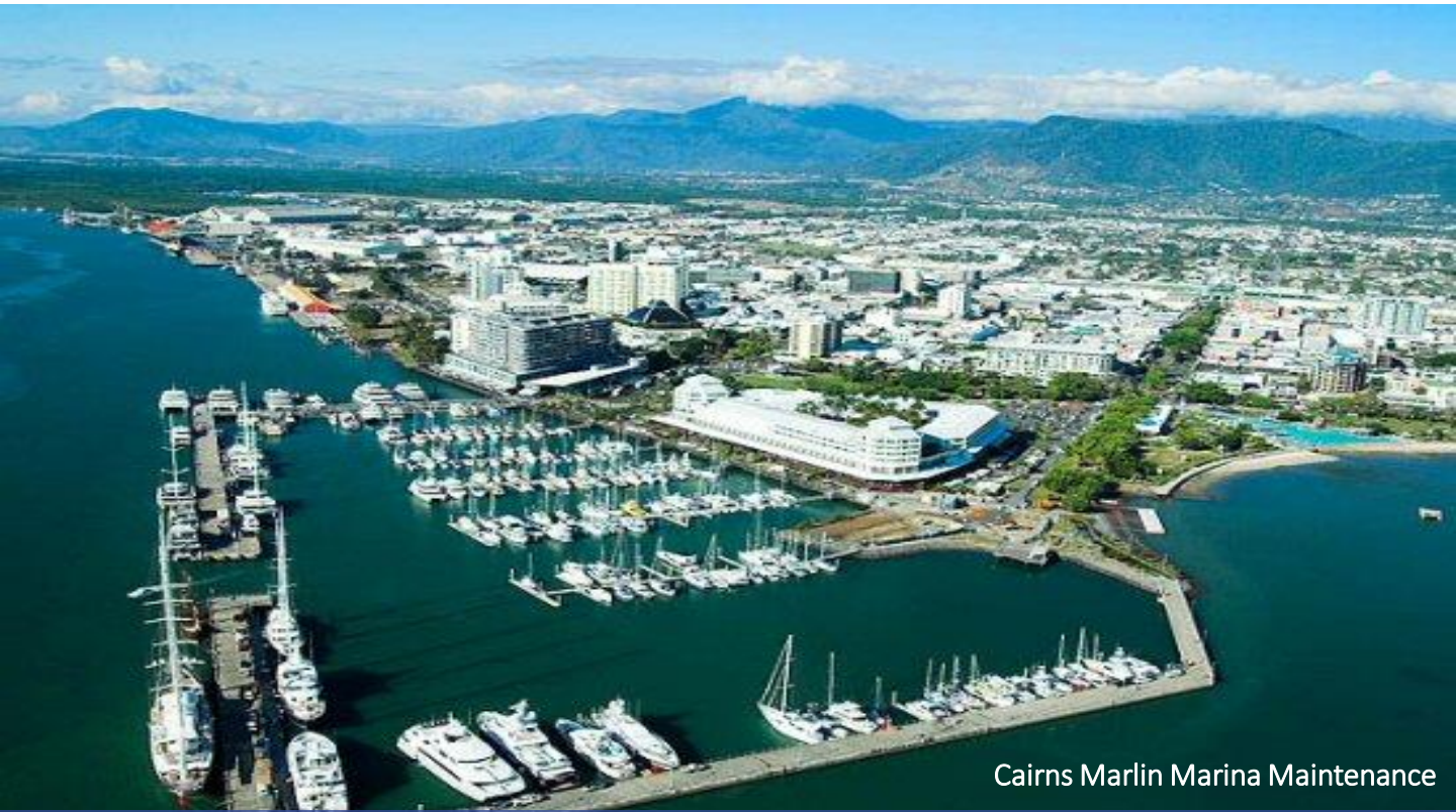
Cairns Marlin Marina Maintenance