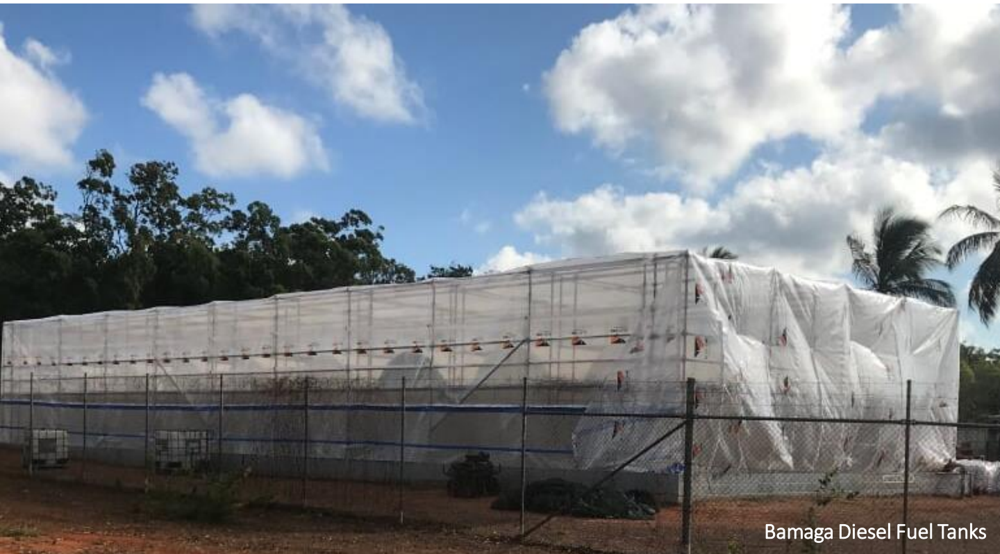
Bamaga Diesel Fuel Tanks