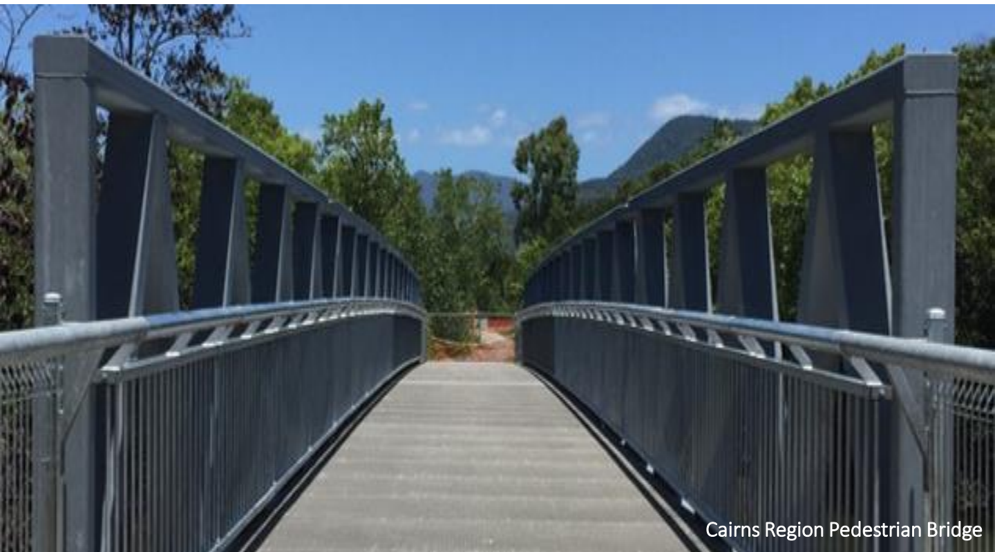
Cairns Region Pedestrian Bridge