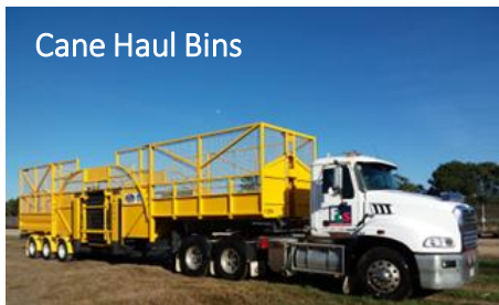
Cane Haul Bins