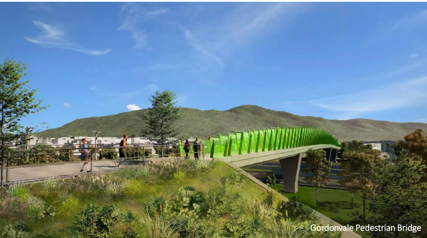
Gordonvale Pedestrian Bridge