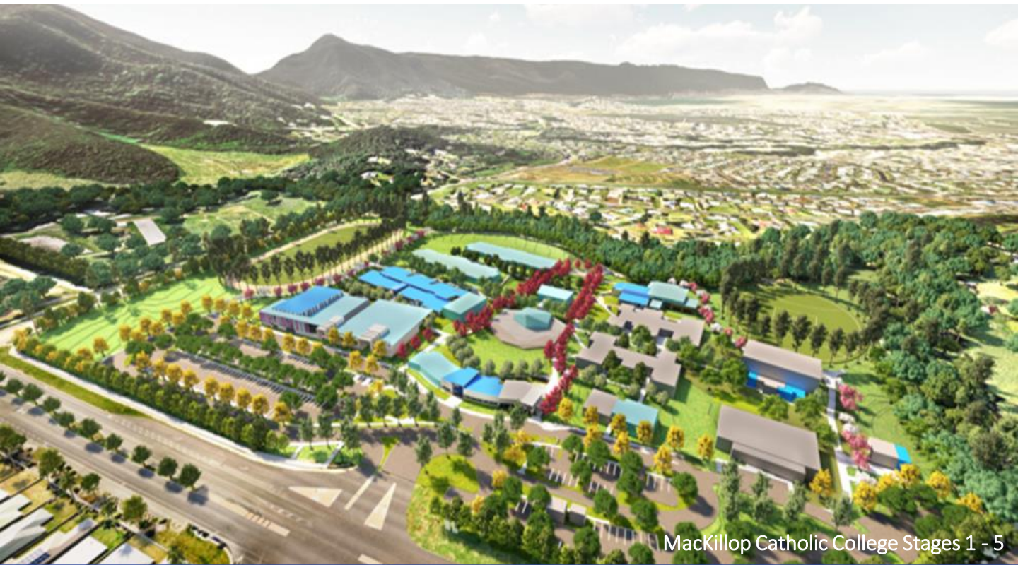
MacKillop Catholic College Stages 1 - 5