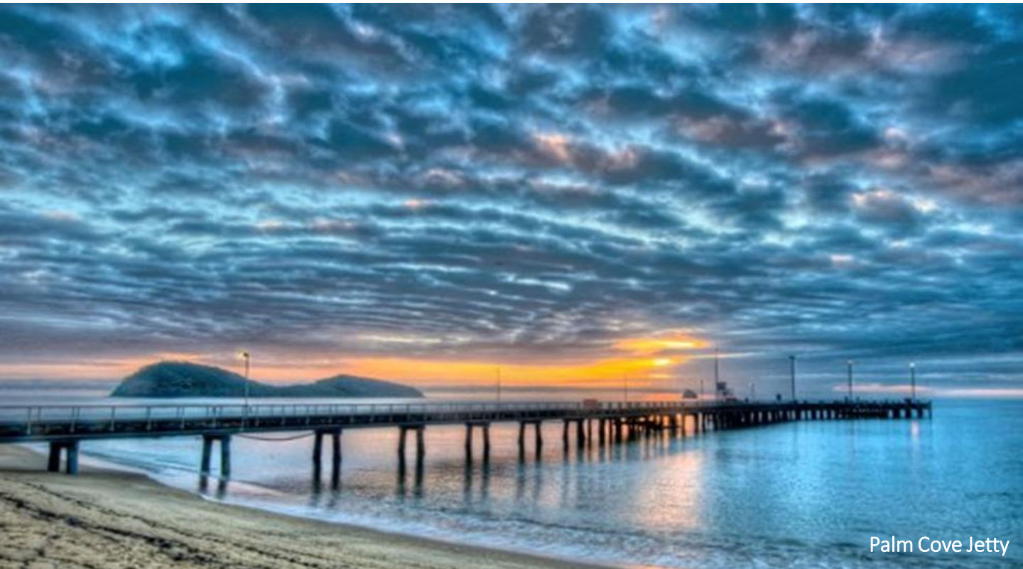
Palm Cove Jetty