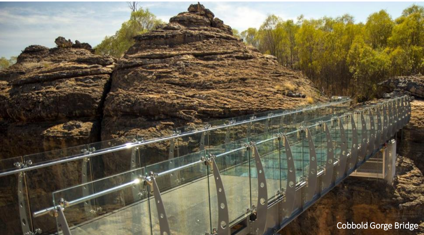
Cobbold Gorge Bridge