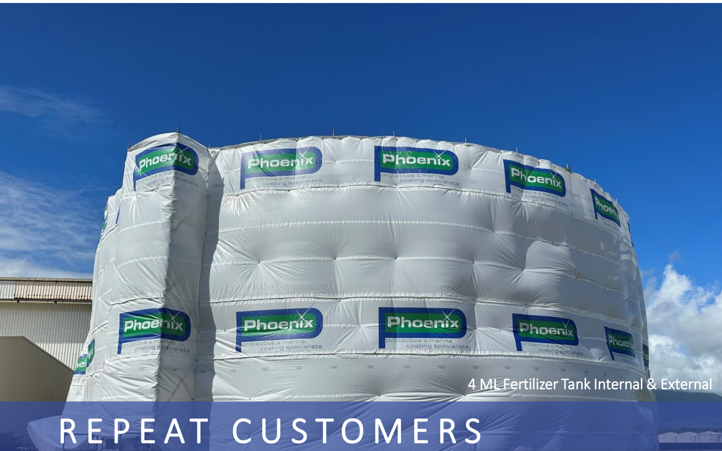
4 ML Fertilizer Tank Internal & External