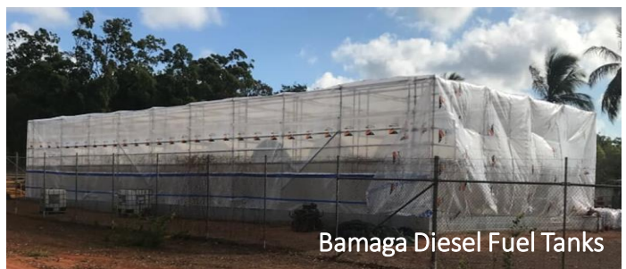
Bamaga Diesel Fuel Tanks