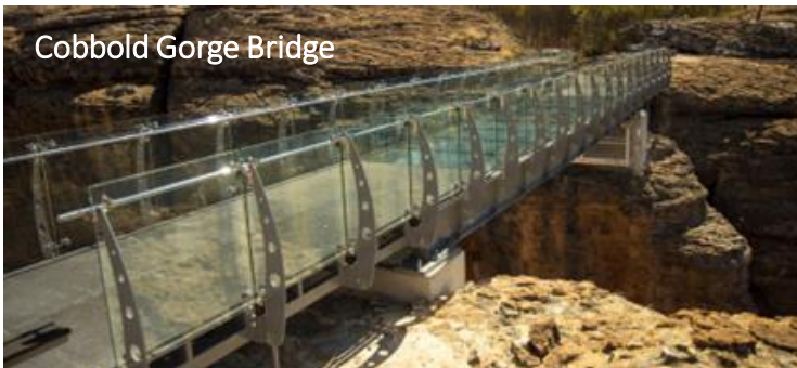
Cobbold Gorge Bridge

Our Cairns based workshop specialises in structural steel, mining assets, hydraulic rams, tanks, machinery , pipework etc.