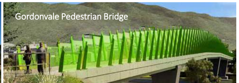
Gordonvale Pedestrian Bridge