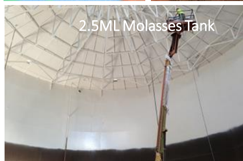
2.5ML Molasses Tank