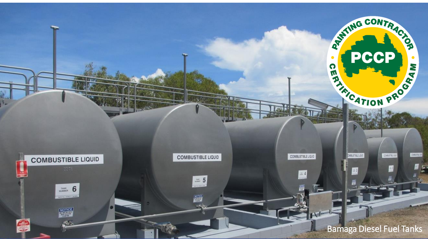
Bamaga Diesel Fuel Tanks